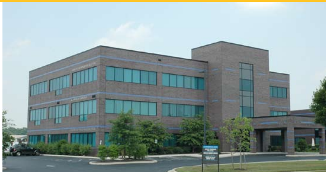
Note: Commercial Buildings shown are located on Eastern Blvd.

Kensington Commercial Park is a premier commercial opportunity in one of Hagerstown's finest commercial locations. It is rapidly becoming Hagerstown's "other" downtown.